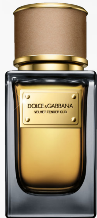
VELVET TENDER OUD by Dolce & Gabanna