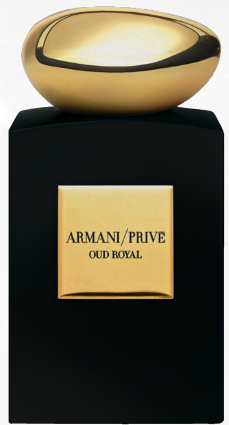
OUD ROYAL by Giorgio Armani