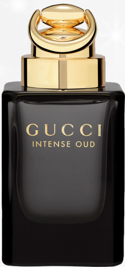
INTENSE OUD by Gucci