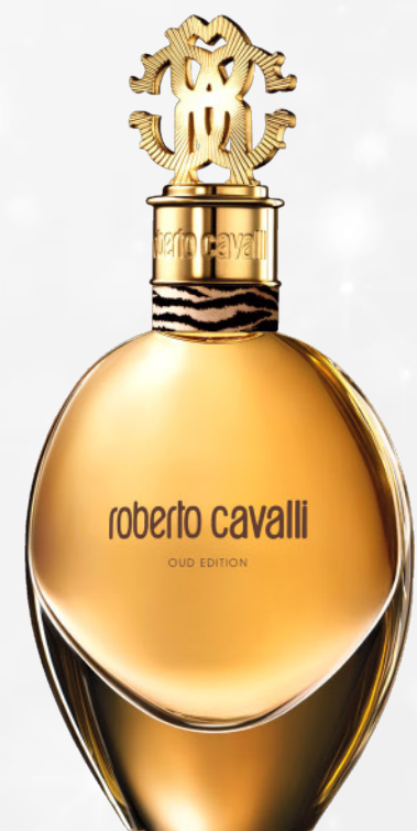
OUD EDITION by Roberto Cavalli