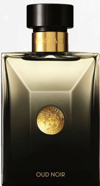
OUD NOIR by Versace