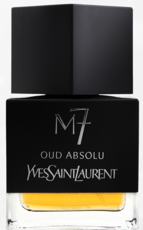
OUD ABSOLU by Yves Saint Laurent