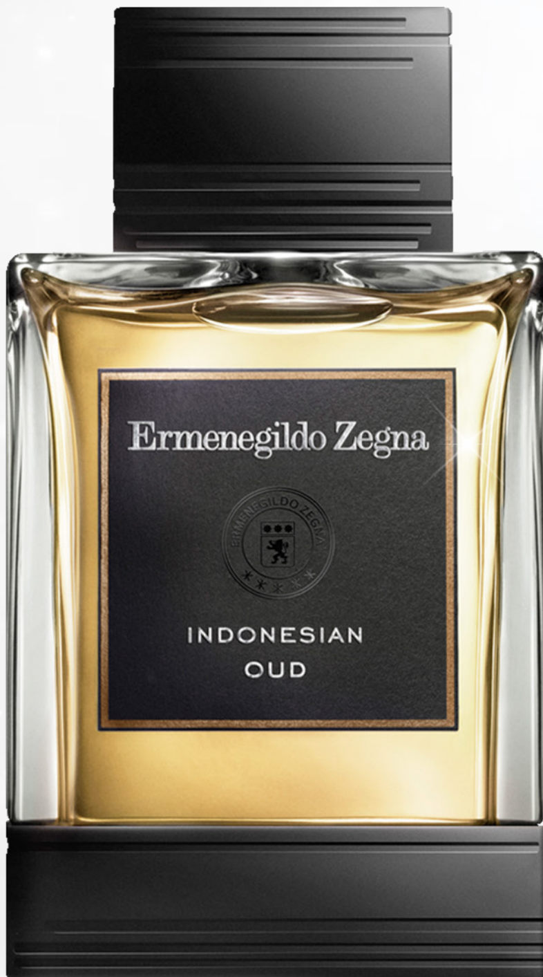
INDONESIAN OUD by Ermenegildo Zegna