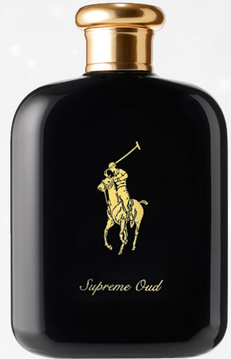
SUPREME OUD by Ralph Lauren

In addition to the fragrances listed, Oud is also used in literally 100's of Middle Eastern ranges and bespoke fragrances; as a base note fragrance for candles, incense sticks, soaps and more recently face and body cream. It can also be used as a raw, undiluted oil and applied to the body daily.