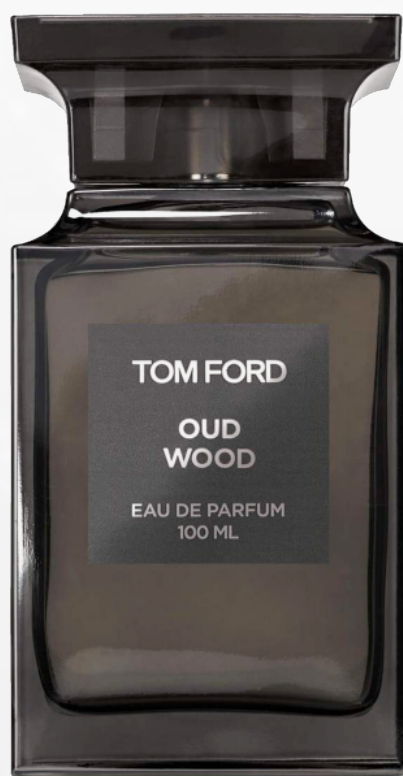
OUD WOOD by Tom Ford