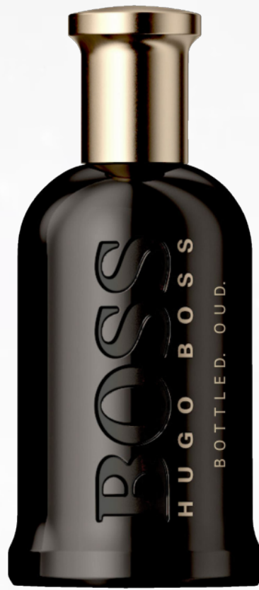
BOTTLED OUD by Hugo Boss